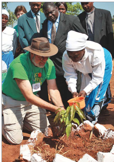
In Malawi, a member of the Women's Guild assists partners from South Sudan and Pittsburgh in planting a mango tree to celebrate the opening of Gondwa Prayer House.